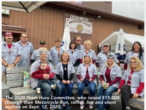
The 2020 Team Huro Committee, who raised $15,000 through their Motorcycle Run, raffles, live and silent auction on Sept. 12, 2020.